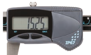
IP67, without data transmission