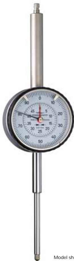
Model shown: M 2/50 S