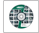
software CD (included)