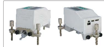
adjustable stand (included)