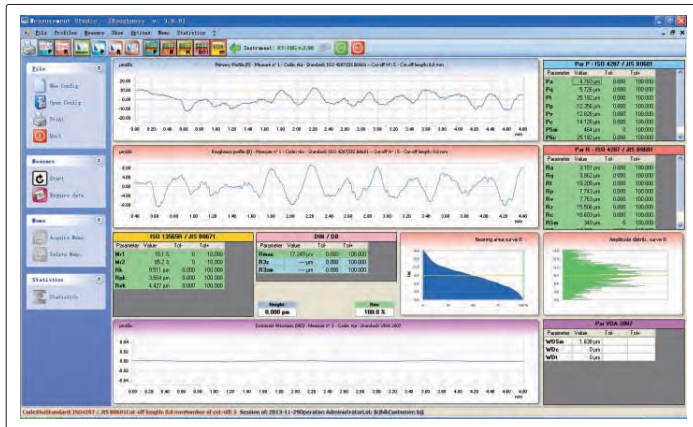
measuring software (optional), can control the roughness tester, display roughness values, profile and curve, data statistics