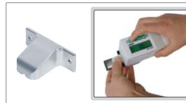
probe cover (included), can put the small workpieces directly on the probe for measurement