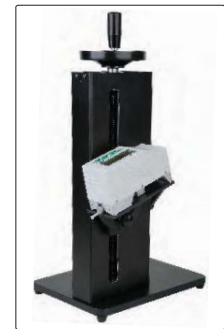
light duty test stand (optional)