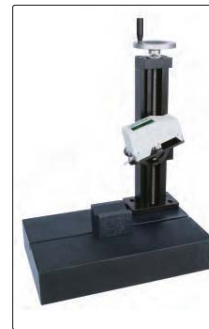
heavy duty test stand (optional)