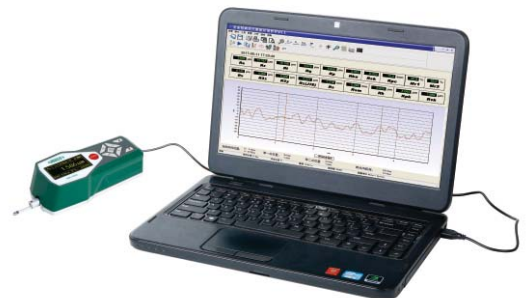
operate roughness tester by computers

connect to computers via USB cable (software is included), display roughness values, profile and curve