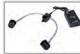
LED auxiliary illumination (optional)