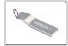
16G USB flash disk (included)