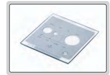
calibration plate (included)