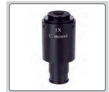
1X camera adapter (optional)