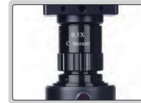
0.5X camera adapter (included)